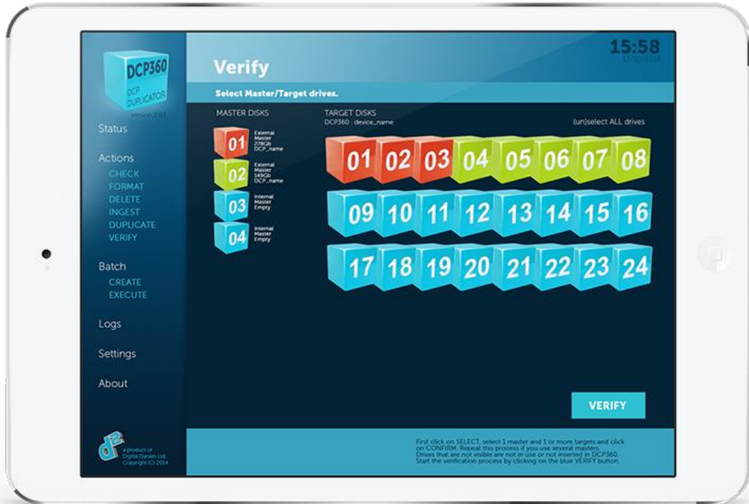
Screenshot 2: Verify process.