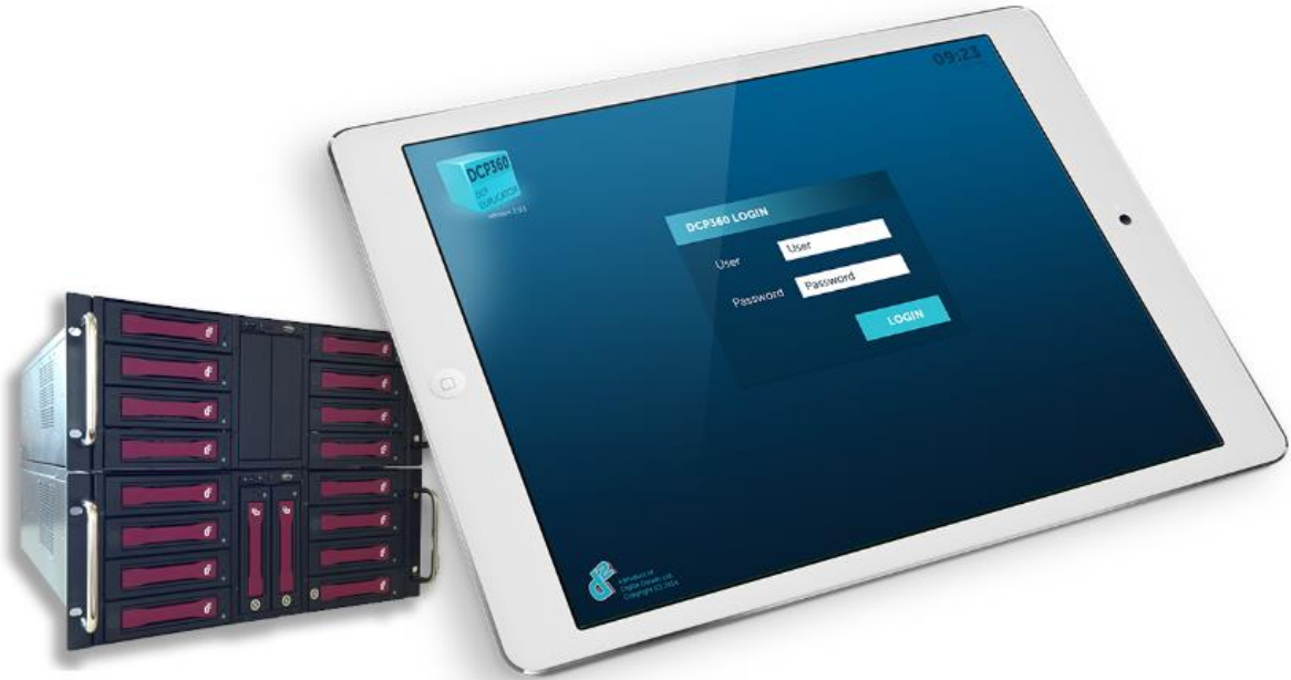
Screenshot 1: D2's DCP360 duplicator & DCP360 App.

D2 launches new DCP360 Application for its DCP360 duplicator range.